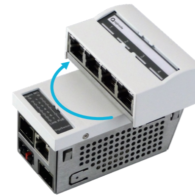
Aginode FTTO Switches as well as the medical Switch with galvanic isolation are available with a rotatable head by default

Aginode is happy to share decades of experience and help define the best solution for your needs. We can help determine specific requirements for the network, as well as energy consumption, maintenance, installation and administration, so that you can determine the optimal, most cost-effective solution. Our experts can help decide how much redundancy you need to build in to maximize availability without overspecifying. Feel free to contact us anytime!